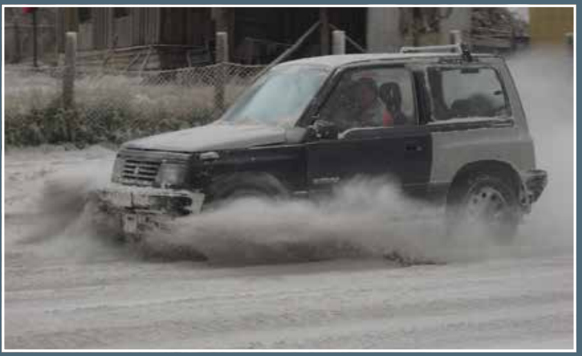
Driving in approximately 10 mm ashfall, near Futaleufu.

The May 2008 eruption of Chaiten volcano, Chile, deposited 30-40 mm of fine-grained rhyolitic ashfall on the town of Futaleufu, Chile.